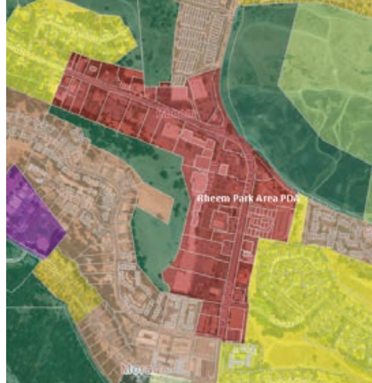
Rheem Park Area red

The report continues, "Second, the Rheem Park Area has